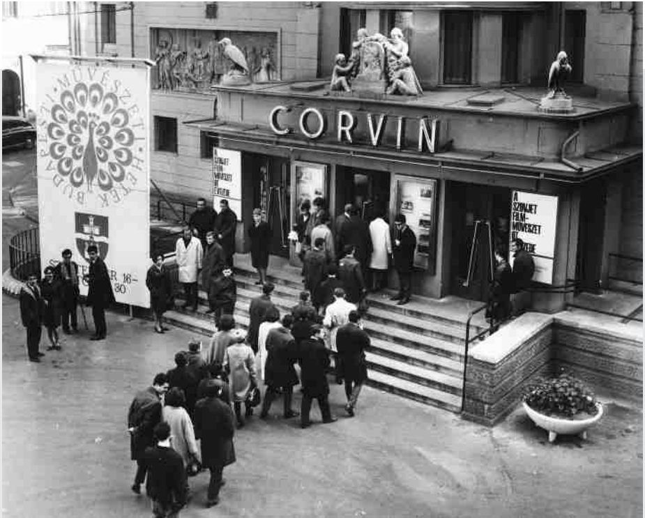
Corvin (Kiskaludgy) köz, Corvin Cinema, 1967