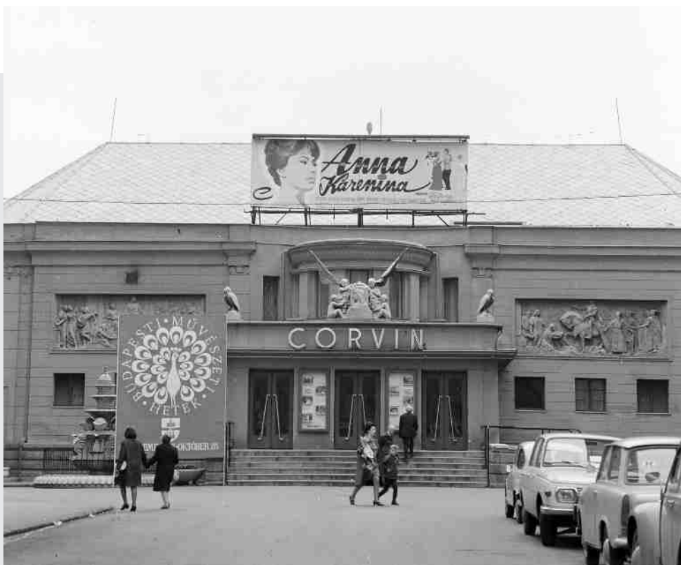
Corvin (Kisfaludy) köz, Corvin Cinema, 1968