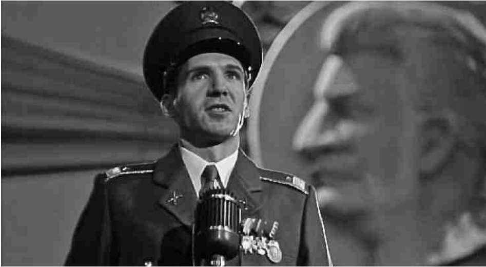
Fig. 9 Ivan as Stalin's "preacher" ( SUNSHINE 1999, 02:00:32).

Ivan has to find his way in his new life. He wants to do something about the injustice done to his father. He becomes a police officer, a member of the machinery that controls every aspect of society in the post-World War II Soviet bloc. There, he is given the task of denouncing former state employees and finding his father's murderers. Ivan searches homes and exposes people. But corruption continues under the new regime. Nevertheless, Ivan remains loyal to the new system. He gives great speeches against fascism and praises Stalin for liberating and saving Hungary from the Nazi reign of terror. Ivan's speech is like a sermon. He worships Stalin like a saint or like God (fig. 9).