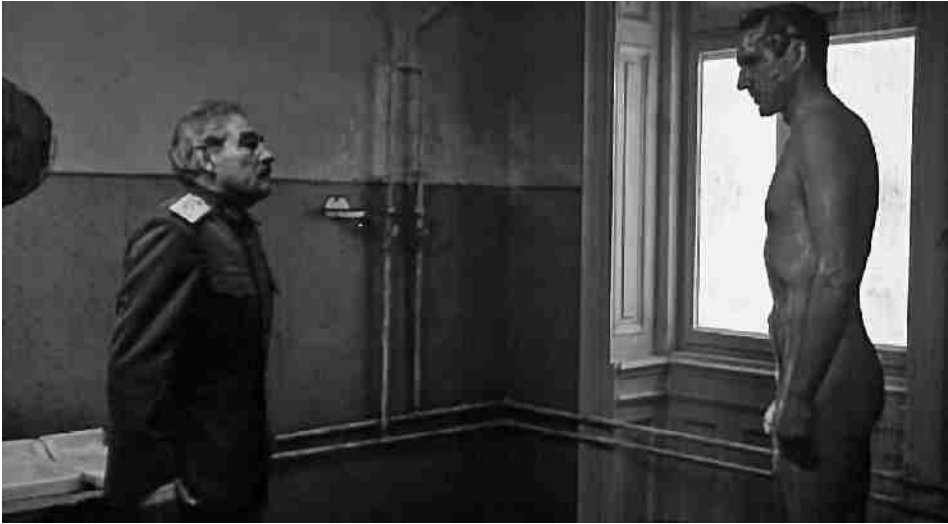
Fig. 10 Ivan testifies to Knorr's innocence in the shower (SUNSHINE 1999, 02:22:54).

Ivan survives, but Knorr is tortured and dies of internal bleeding. Ivan must identify the body. A relative asks him to make a speech at the grave. It is here, at the grave, that Ivan turns away from his former professional life.