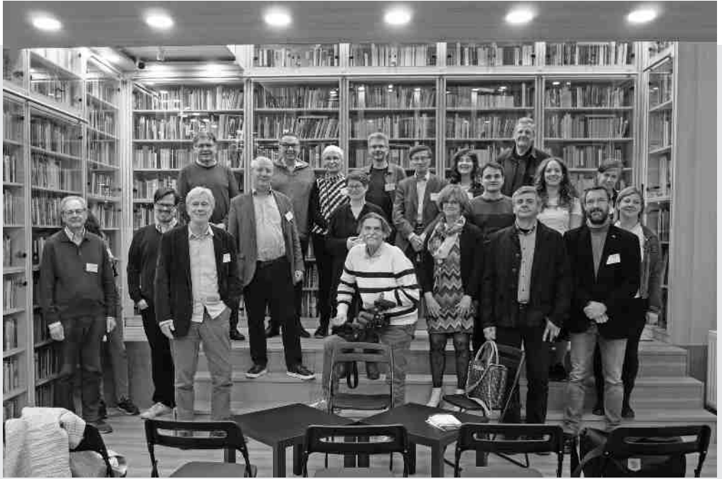
Participants of the 2023 Budapest Interfilm Seminar