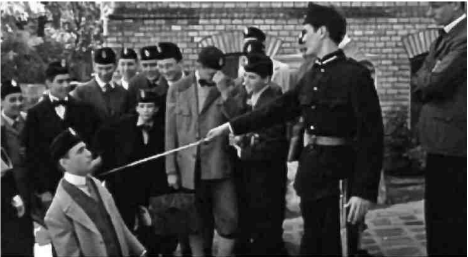
Fig.4 Adam is threatened by colleagues because he is Jewish (SUNSHINE 1999, 00:57:32).