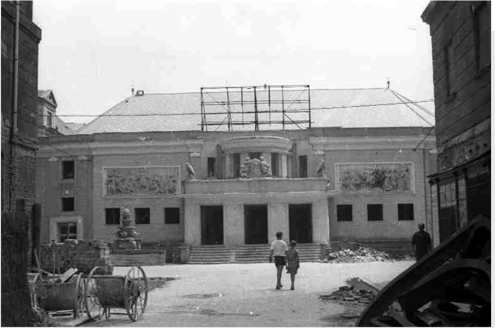
Corvin (Kisfaludy) köz, Corvin Cinema, 1957