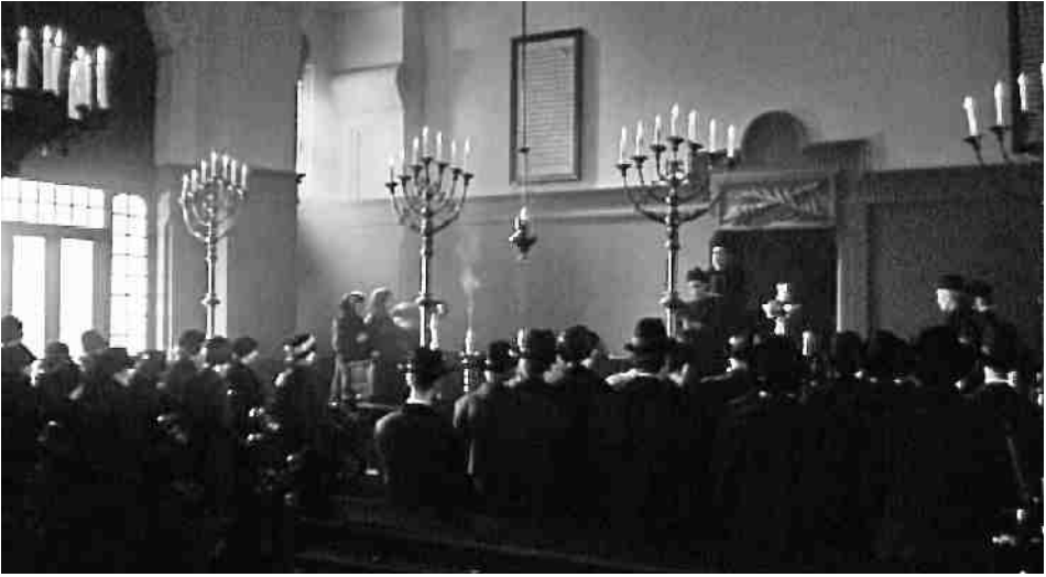
Fig. 3 Funeral of Ignatz in the synagogue (SUNSHINE 1999, 00:57:10).