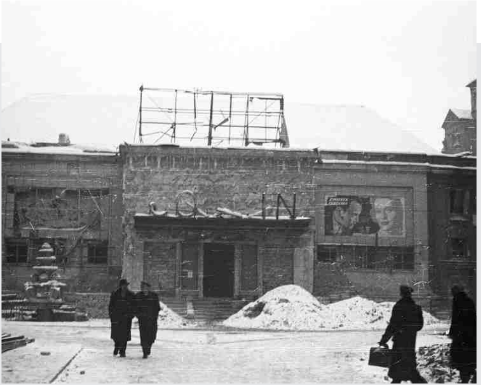
Corvin (Kisfaludy) köz, Corvin Cinema, 1956