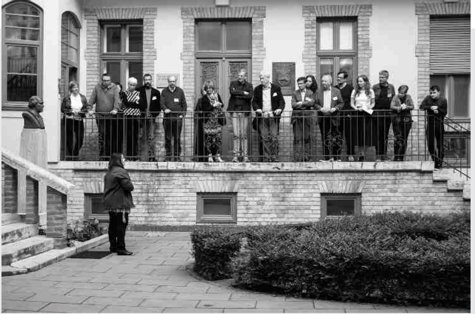
Participants of the 2023 Budapest Interfilm Seminar