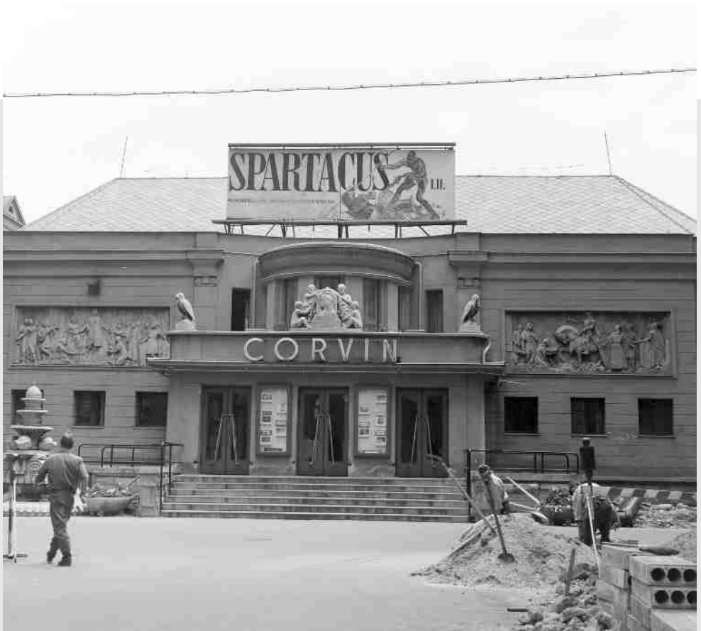
Corvin (Kisfaludy) köz, Corvin Cinema, 1970