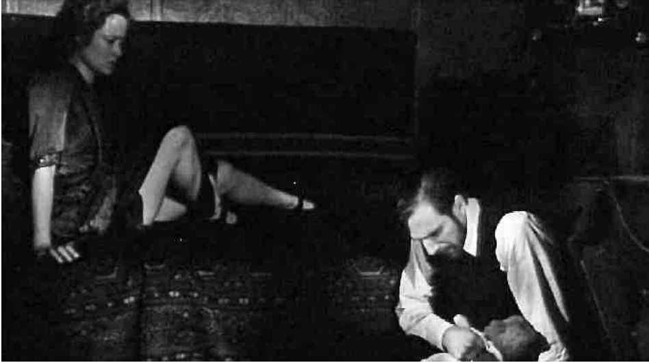
Fig. 2 Ignatz is a broken man ( SUNSHINE 1999, 00:50:04).

The anniversary of Emanuel's death coincides with that of the Austro-Hungarian Emperor. With the death of the emperor, previous values seem to crumble, and with them, the just treatment of the Jewish population. This makes the search for identity more difficult, especially for the Jewish people.