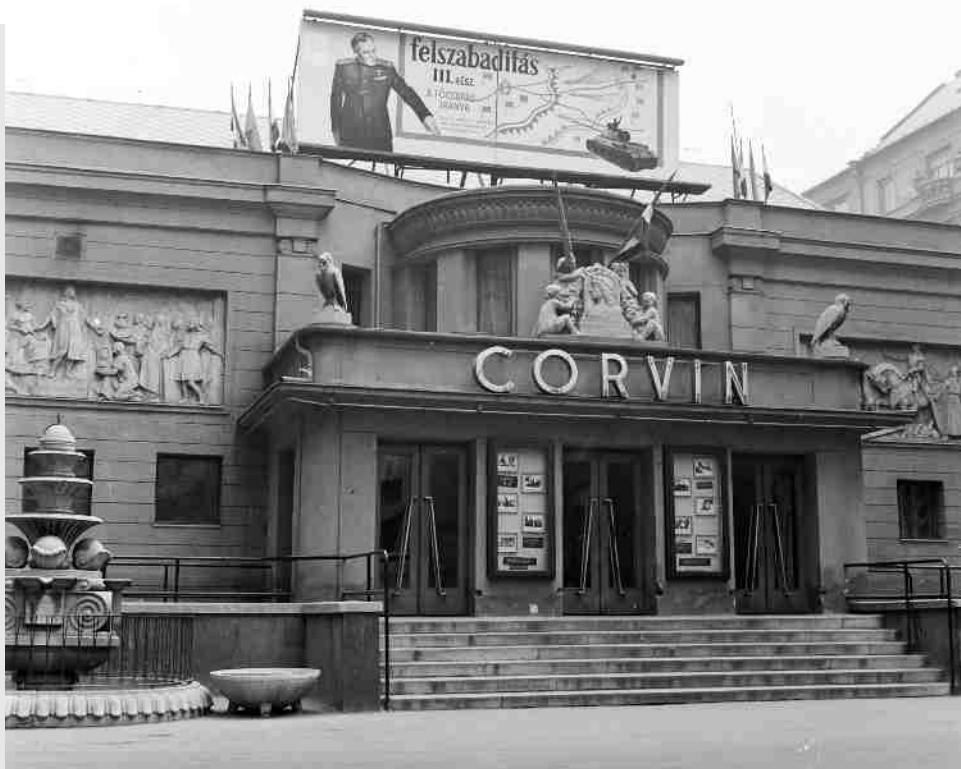
Corvin (Kisfaludy) köz, Corvin Cinema, 1970