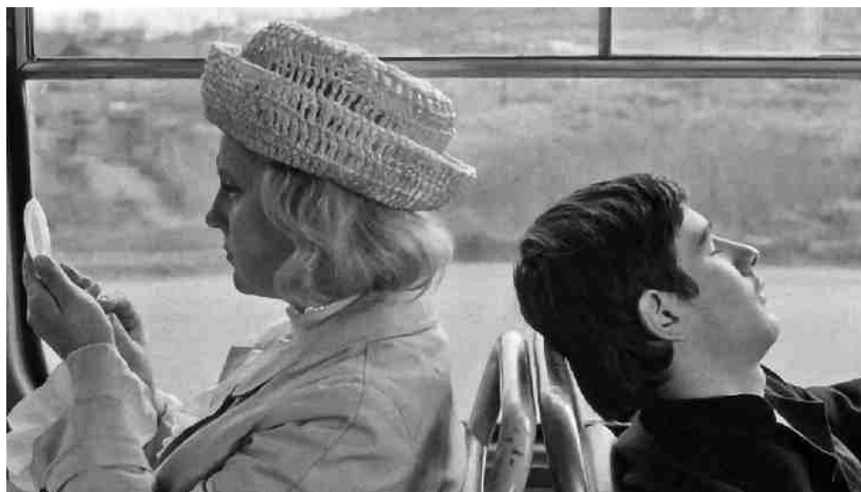
The Long Goodbye

did everything differently than was required by “Socialist Realism”. Her radicalism was expressed above all in the form, less in the plot. She worked with documentary elements, built dreams and irritating close-ups in, and played with the sound and so forth. When the film was finished, a scandal broke out. The director of the Odessa Film Studio and Muratova herself were fired. She went to Leningrad for several years, where she worked in a public library. In 1983, she returned to Odessa. Here she filmed „Under Gray Stones“. This morbid dream play was cut so badly by the censors that Muratova removed her name from the opening credits.