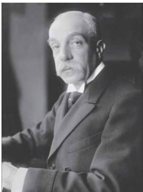
Figure 3: Ambassador Dumba 26

One of the major scandals concerning Hungarians during the course of the war was the infamous Dumba Affair. Konstantin Theodore Dumba (1856–1947) was the last Austro-Hungarian diplomat accredited to serve as Ambassador to the United States. He was in office from March 4, 1913 to November 4, 1915. Dumba, in a letter he had sent to his government, admitted to being part of a scheme that attempted to use strikes and sabotage by immigrant workers to keep American companies from fulfilling their contracts with Allied states. 27 In the documents found by the British Royal Navy, ambassador Dumba had proposed a plan to “disorganize the manufacture of munitions of war” in the United States. As a part of this scheme, Dumba also suggested funding a number of foreign-language newspapers published in America to influence Hungarian laborers. The Wilson administration was naturally outraged by this scheme and deemed it a particularly dangerous attempt to take advantage of the heterogeneous population of the USA. 28 Consequently, Dumba was soon recalled from service.