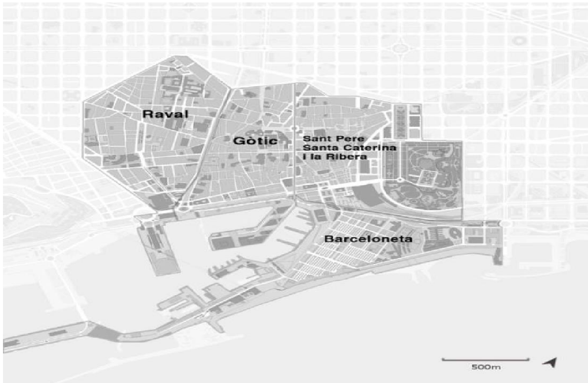
2. Picture Ciutat Vella

These four neighbourhoods are la Barceloneta, Sant Pere Santa Caterina y la Ribera (which is too long so locals refer to it as "el Born"), el Gothic and el Raval (Picture 2.). At this point it is important to note that first I used the term "Raval district", which is not correct as one of the first informants made clear for me. The Raval is a neighbourhood, such as the other three, in the district of Ciutat Vella, however in some of the studies of the neighbourhood the incorrect term is used. In the last decades Ciutat Vella, like many other old neighbourhoods in European countries, went through urban renewal programs. These programs in the case of Barcelona are called PERI, (Special Plan for Interior Reform) which try to target regeneration, attract new investments and reducing socio-spatial inequalities (Arbaci & Tapada-Berteli, 2012:287-289; Pareja & Tapada, 2001:4). Later on it will be referred to how these processes could be considered gentrification or goes along with the phenomenon of gentrification, which is considered as a harmful process for the neighbourhood by local activists.