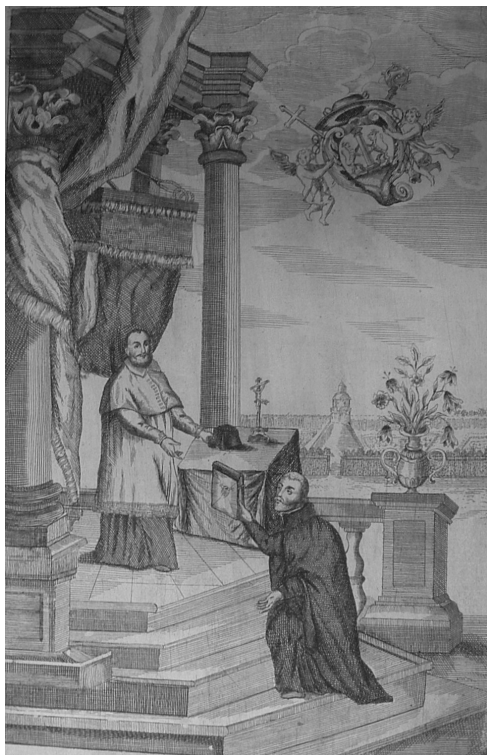
Das einzige bisher bekannte ungarische Dedikationsbild aus dem 17. Jahrhundert in dem Buch von Zacharias Trinkellius: Divinatorium viae et vitae aeternae . Wien, 1663. (OSZK, RMK III 2201.)

ungarischsprachigen Werke 338 beträgt. Die 610 Prätexte teilen sich in 495 Dedikationen (in Form von Dedikationsbriefen, -bild, -gedichten oder -tafeln) und 152 Vorreden auf. Eine derart starke Dominanz der Dedikationen gegenüber der Vorrede wurde im Zusammenhang der westeuropäischen Literatur nicht beschrieben. Das Überwiegen von Dedikationen im Korpus kann unter anderem mit der formalen und funktionalen Vermischung der Gattungen Dedikation und Vorrede begründet werden. Diese Erscheinung erklärt sich, laut Gertrud Simon, durch den gemeinsamen Ursprung der beiden Gattungen. Die Mischformen können auf die antike Einleitung zurückgeführt werden, in der die Präfationen mit Ansprachen ergänzt wurden und ihren inhaltlichen sowie stilistischen Besonderheiten unterliegen. 24