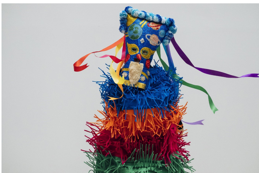
Figure 2: One of the masks used by Sofia Pride.

The idea behind the transformation into a kuker, but colourful, in Pride colours, carries the message that our efforts to achieve equality must be aimed at removing internal barriers in people—prejudices. It is time for the evil spirit of homophobia and transphobia to leave Bulgarian society.