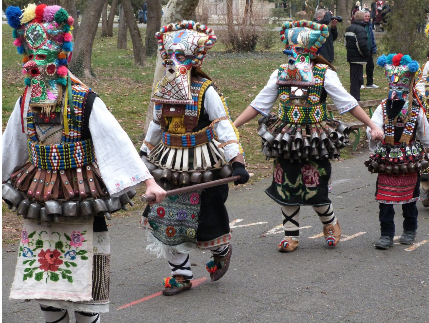
Figure 1: Kukeri from the region of Yambol, Southeastern Bulgaria. February 2017.

'legitimate' content, meanings, and bearers. Consequently, I am interested in the alternative versions of heritage consciousness and the effects on living traditional practices produced by such interactions. Creative rearticulations and political instrumentalisations of masked customs that reveal performatively a spectrum of wider social issues are thus accentuated to offer additional insights on the vernacularisation of anti-gender campaigns and the formation of counterforces to illiberal discourses and policies.