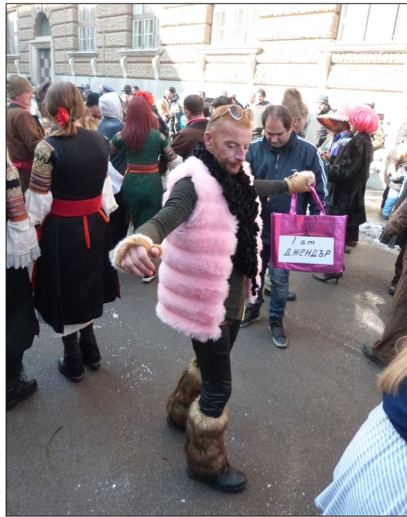
Figure 3: 'I am džendār': the kukeri Gender character. Photograph by the author, January 2018.

Szulc, 2016; Ayoub & Chetaille, 2017; Uibo, 2019). Most of them embrace such strategies to revisit the heteronormative boundaries of nation and citizenship, to counter the accusation of foreignness, without necessarily appropriating homonationalism or exclusionary nationalism.